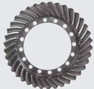
The front differential ring gear encounters extreme pressure and sliding contact, inviting accelerated wear. AMSOIL 75W-90 Long Life Synthetic Gear Lube completely prevented pitting and scoring. The gear earned a nearly perfect wear rating of 9 out of 10, indicating only trace levels.

See the Foster Transmission Field Study Brochure (G2961) for complete transmission disassembly results.