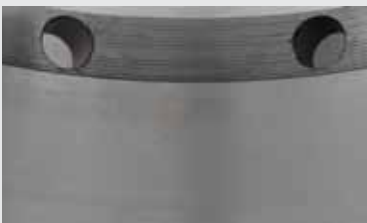
The transmission's output shaft bearing demonstrated no pitting or scoring despite frequent high-load operation. It earned a high wear rating of 8 out of 10, indicating only trace-light wear.

Life Synthetic Gear Lube in OTR trucks used in real-world, heavy-duty service. After 512,000 miles, the transmission and differentials from a randomly selected truck were disassembled and rated for wear, pitting, scoring and other distress by an ASTM calibrated rater. Results prove both lubricants provided exceptional protection against wear and other distress for long component life (see photos below).