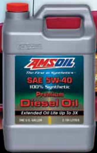
SYNTHETIC MOTOR OILS