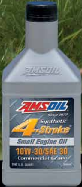
SYNTHETIC MOTOR OILS