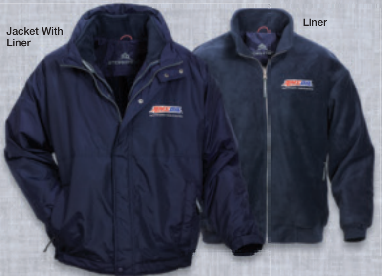
Jacket With Liner